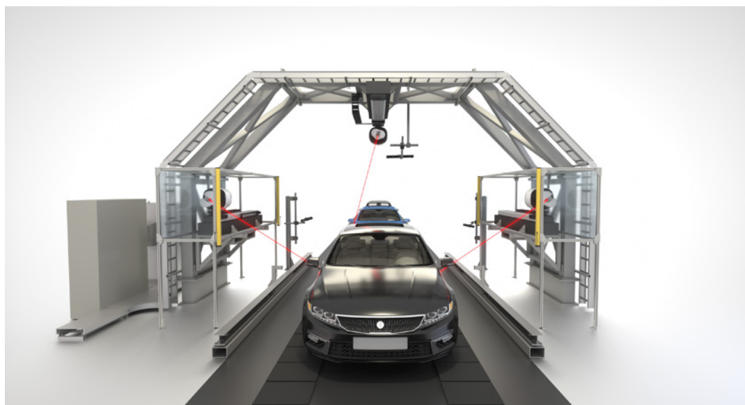
The APDIS Laser Radar Gap & Flush System employs three APDIS Laser Radars to cover a large volume and inspect gap and flush on a moving line; operator and product safety is enhanced with the system's large stand-off.

With an impressive measurement speed of up to six times that of a fixed CMM, the APDIS MV430E provides the fastest Laser Radar feature measurement speed. This speed allows the efficient inspection of critical features in the takt time of the line, or a sampling strategy to cover more features over a set of car bodies, or even a bypass line for