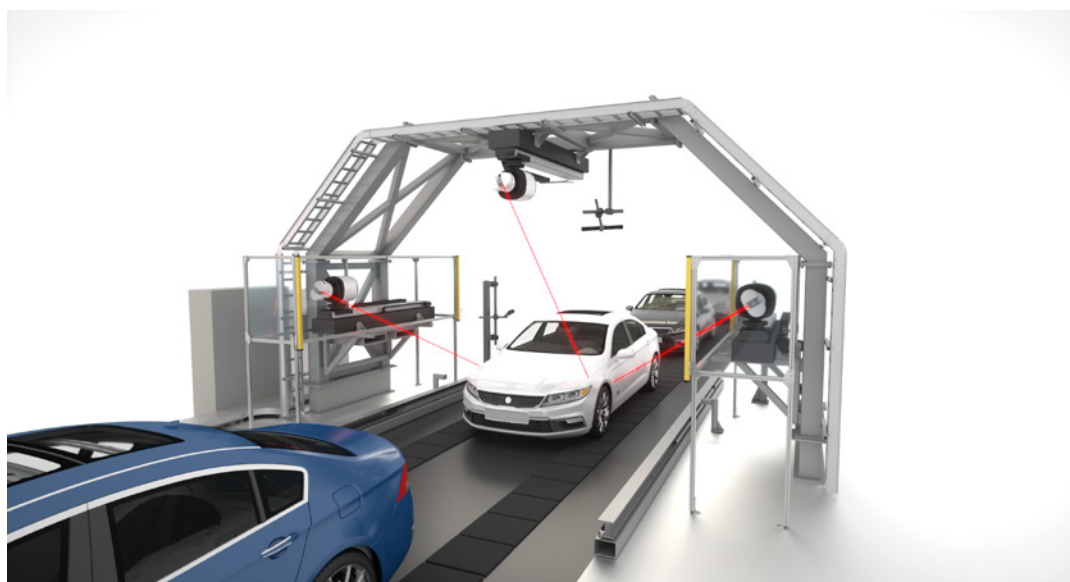
In the Gap & Flush System, APDIS movements are synchronized with conveyor movement; necessary modifications can then be made safely and easily off-line without slowing normal production speed.