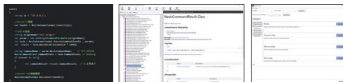
Sample of code

– A suite of tools makes it straight forward to build the routines.