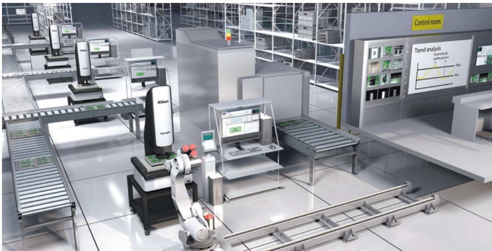
Illustrative example of "NEXIV" operation using "Remote Control SDK". Please take the appropriate safety measures when installing.

The remote control Software Development Kit (SDK) is a tool for developing user software modules to control and automate the NEXIV video measuring systems. Automate component carriers and measurement steps remotely or on the production floor by integrating NEXIV together with the component carrier conveyor system.